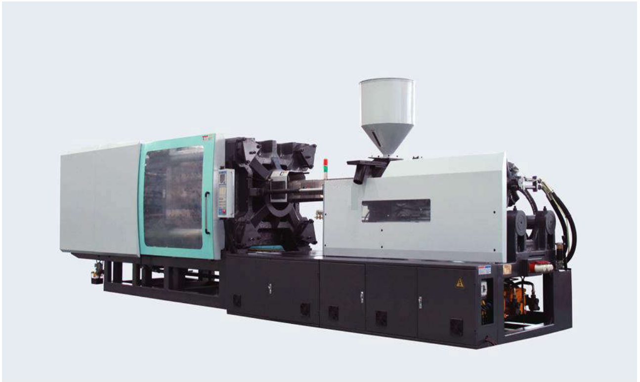
Injection molding machine

Injection parts widely applied in mobile case, communication, appliance, computers, electronics ,toys, clocks ,motors and other industries.